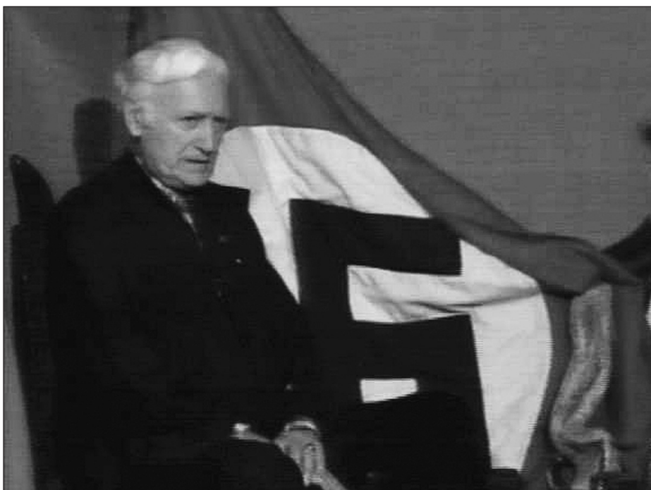
Former Chilean Nazi Miguel Serrano, whose work Kurtagic is eagerly translating

* Interested readers are referred to Nicholas Goodrick-Clarke's, Black Sun: Aryan Cults, Esoteric Nazism and the Politics of Identity , NYU Press, 2002; Joscelyn Godwin, Arktos: The Polar Myth in Science, Symbolism and Nazi Survival (Adventures Unlimited Press, 1996)